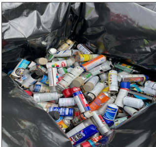
Lancaster County 10.15.2022