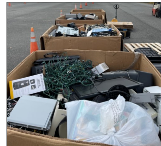
Northumberland County 10.29.2022