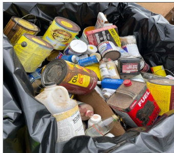
Richmond County 10.22.2022